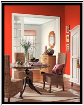
Holly Berry 1321

The following colors are offered at $3.55/sf: