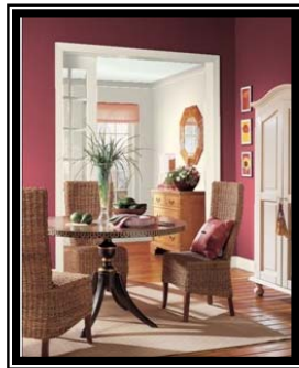
Raisin Torte 2083-10