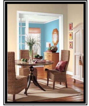
Shaker Beige HV-45

The following colors are offered at $3.55/sf: