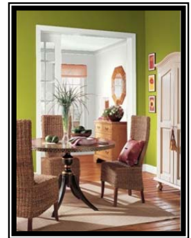
Dark Celery 2146-10