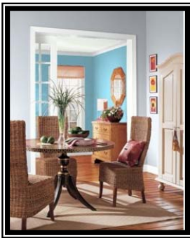
Gray Timber Wolf 2126-50

The following one coat colors are offered at $1.40/s.f.: