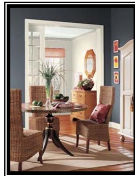
Black Horizon 2132-30