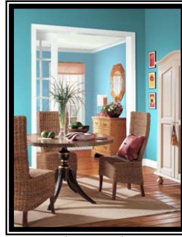
Blue Lake 2053-40