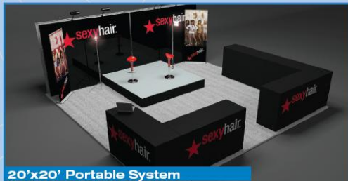
20'x20' Portable System