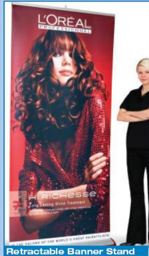
Retractable Banner Stand