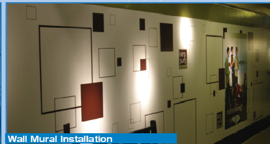
Wall Mural Installation