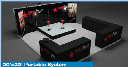
20'x20' Portable System