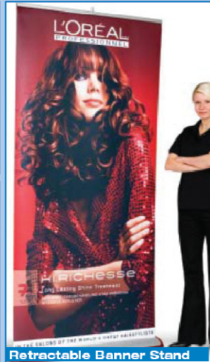
Retractable Banner Stand