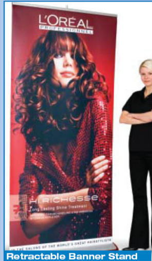
Retractable Banner Stand