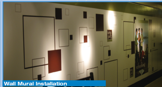
Wall Mural Installation