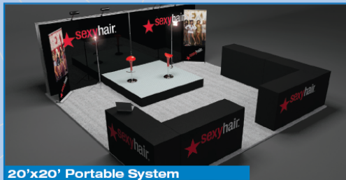
20'x20' Portable System