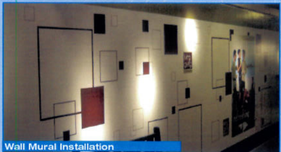
Wall Mural Installation