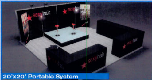
20'x20' Portable System