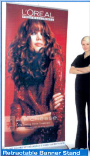
Retractable Banner Stand